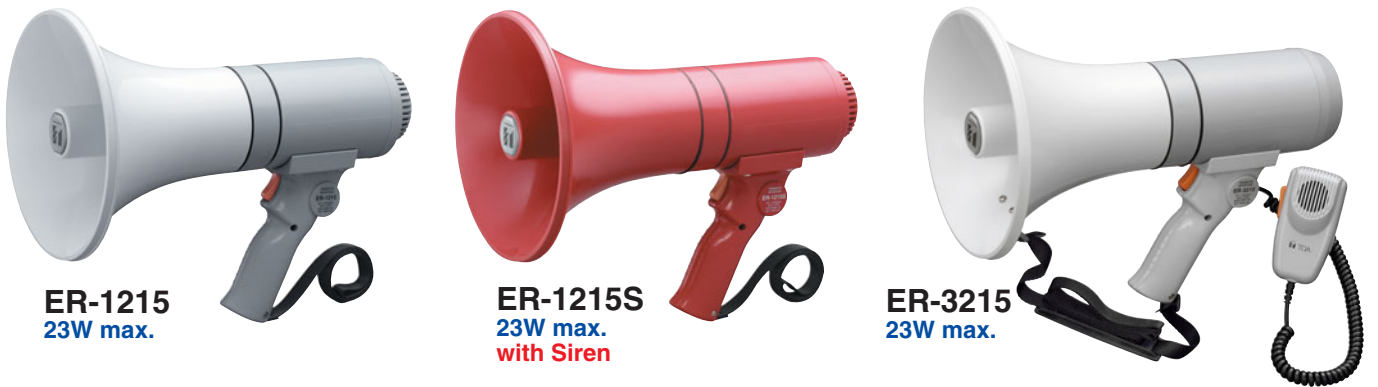
ER-1215 23W max.