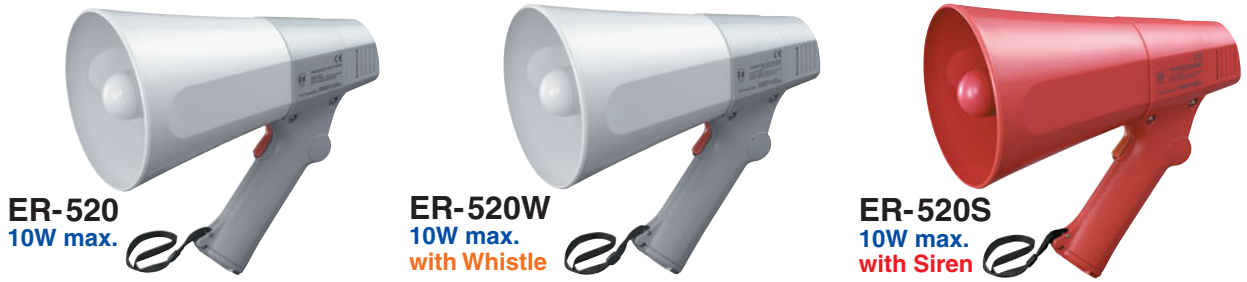
ER-520 10W max.