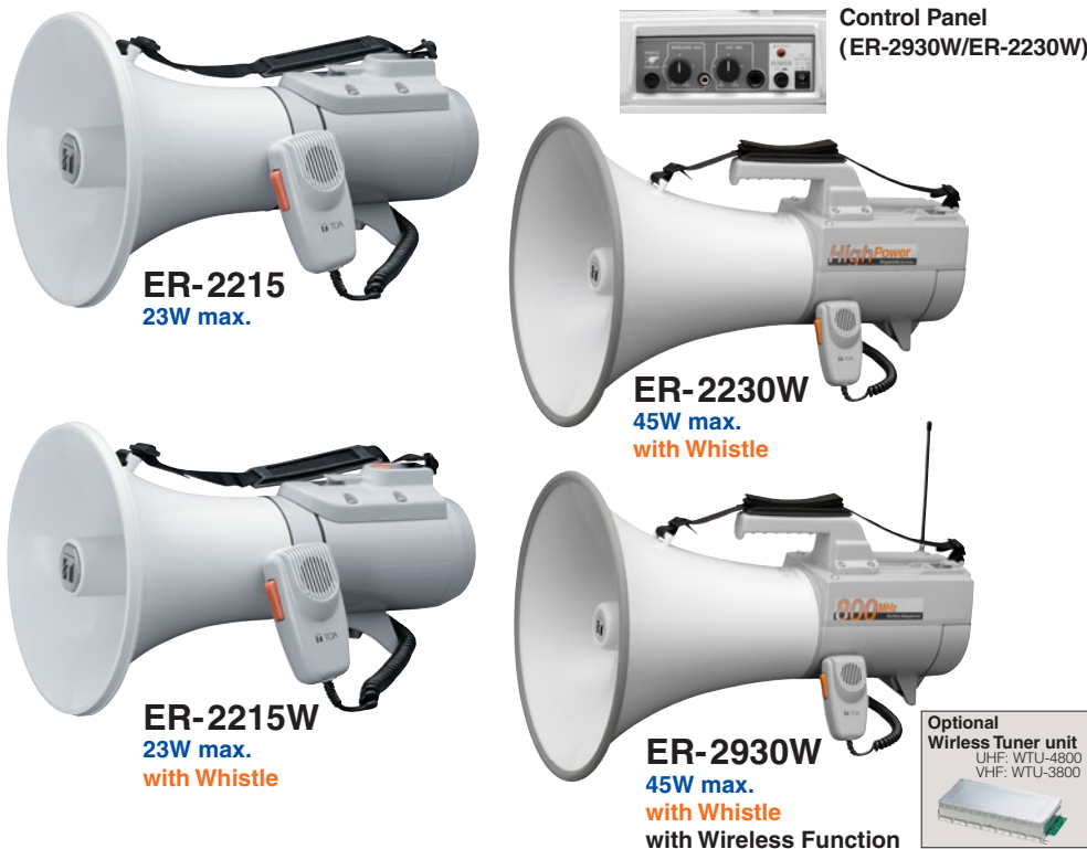
ER-2215 23W max.