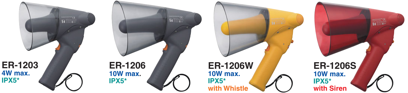
ER-1203 4W max. IPX5*