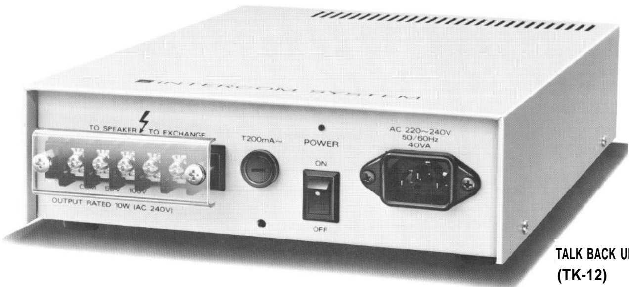
TALK BACK UNIT (TK-12)