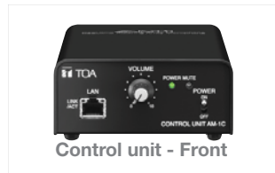
Control unit - Front