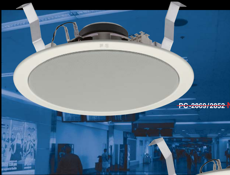
PC-2869/2852 Not Available in Canada

Finely crafted design with thin panel that does not detract from venue architecture or interior decor.