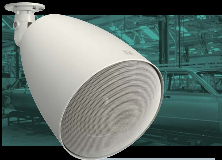
PJ-64/304 Projection Speaker Supplied brackets ensure flexible speaker direction changes.

High sound pressure level of up to 30W input ensures excellent sound reproduction in high-ceiling and wall-mount applications.