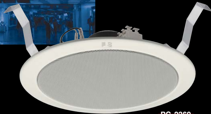
PC-2369 Not Available in Canada