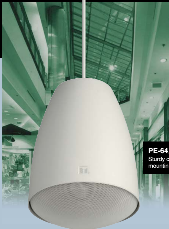
PE-64/304 Pendant Speaker Sturdy cable, extendable up to 5 meters, enables speaker mounting even from a high ceiling.