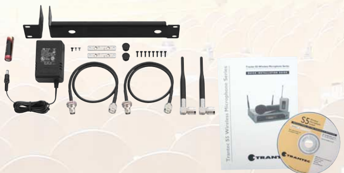
S5.5-HD Handheld Microphone Set